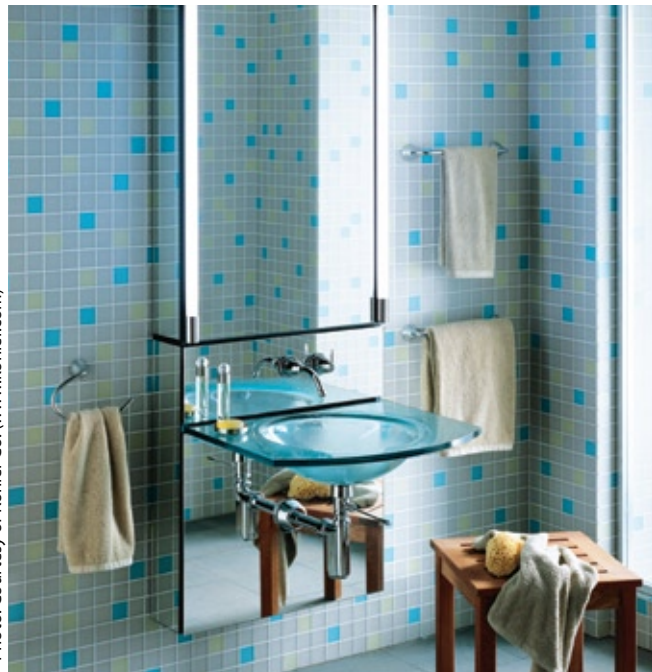
In addition to a mirror, this cabinet by Robern provides welcome storage.