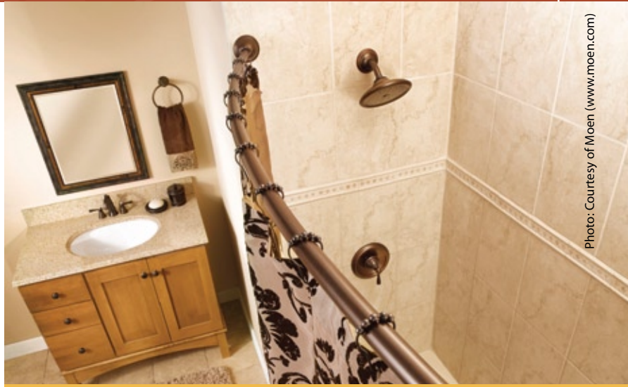
The Adjustable-Length Curved Shower Rod from Moen adjusts to fit shower enclosures from 54- to 72-inches.

Expand the Ceiling. Create the illusion of a taller bathroom by having it painted the same color as the walls. This produces the visual sensation that the walls extend farther up than they do. Or create a roomier feel by having crown molding installed. The crown molding should be painted the same color as the ceiling so it doesn't break up the line of vision, making the space seem lower to the floor.