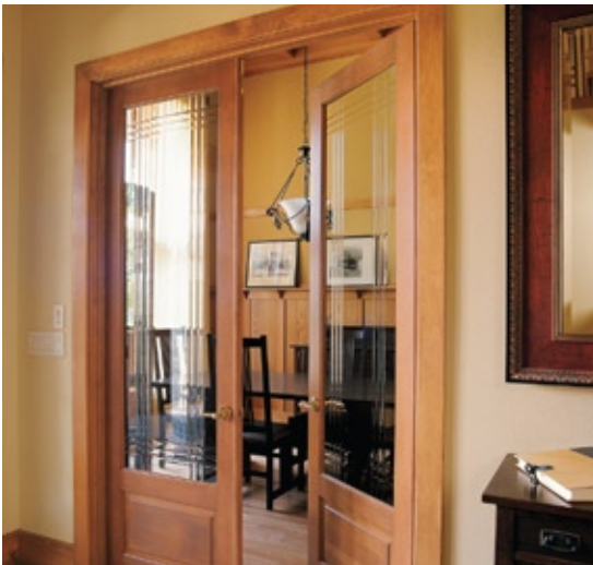
These interior doors maintain privacy, yet allow two rooms to share natural light.