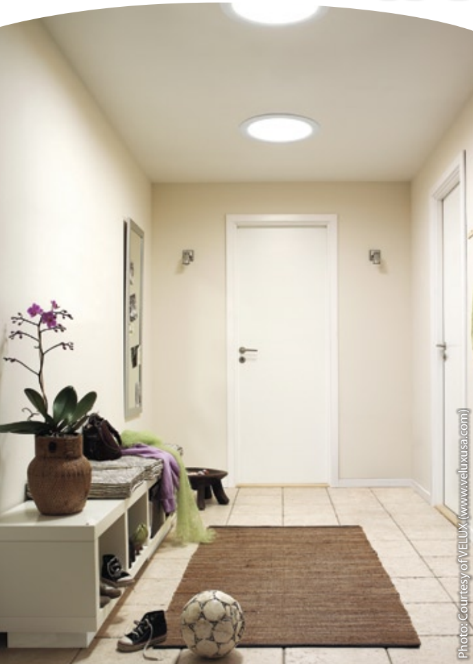
A tubular skylight brings daylight to an otherwise dark hallway.